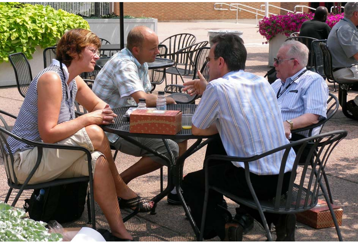
"I'll make you a deal, you share this lunch box with me and I'll tell you about a fantastic discovery we made in Belgium"