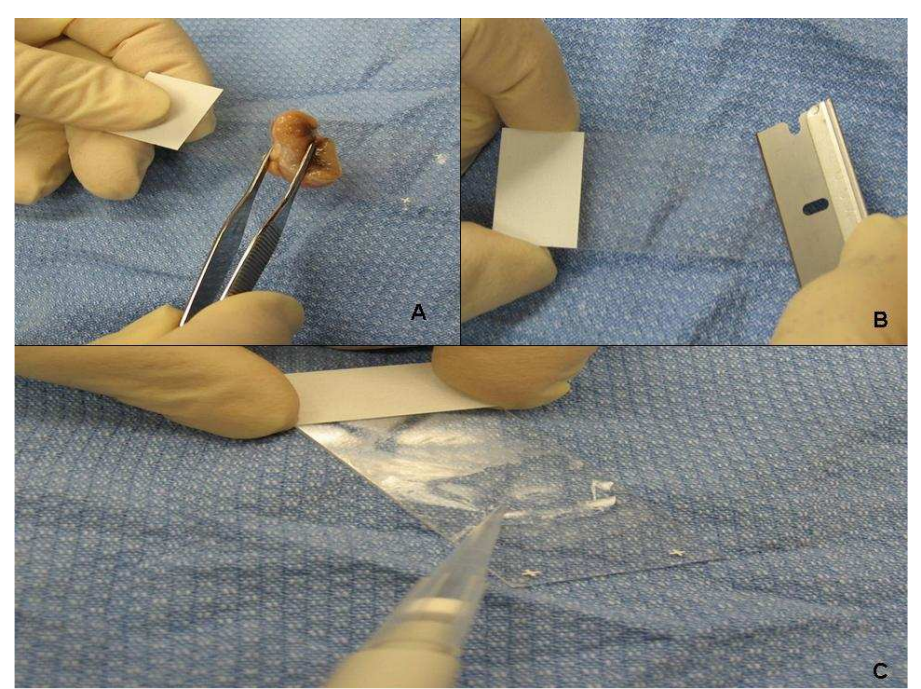
Fig. 1. Blotted tissue impressions: (A) Tissue is pressed onto slide several times; (B)Using a razor blade, tissue is scraped on NaOH solution several times with a back and forth motion; (C) A filtered pipette tip is used to remove homogenate for collocation in tube.

<sup>*</sup>ER=ELISA ratio: <1.5:negative; 1.5-1.9: inconclusive; 2.0-2.5: low positive; >2.5: high positive